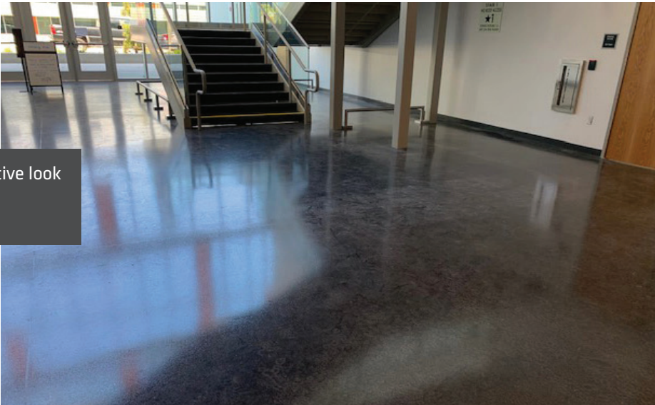
Reflect by Liquid Elements provides a decorative look for event spaces in LATTC's culinary school.