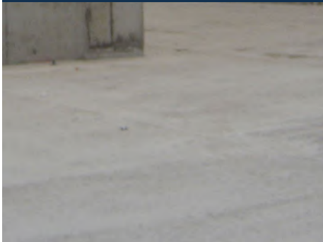
3000 m 2 high-performance lining system Stonchem 656 was installed

THE STONHARD DIFFERENCE Stonhard is the unprecedented world leader in manufacturing and installing high-performance polymer floor, wall and lining systems. Stonhard maintains 300 Territory Managers and 175 application crews worldwide who will work with you on design specification, project management, final walk through and service after the sale. Stonhard's single-source warranty covers both products and installation.